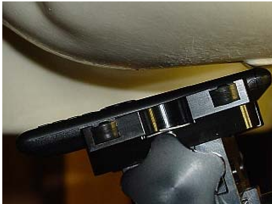
Figure 9E.2 Phone against the head (Left Tilt position)