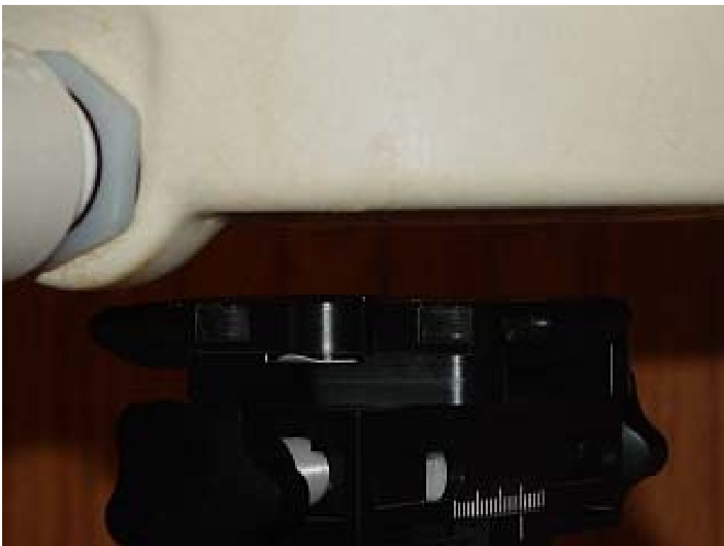
Figure 9E.4 Body SAR setup (15mm Air Separation - Front)