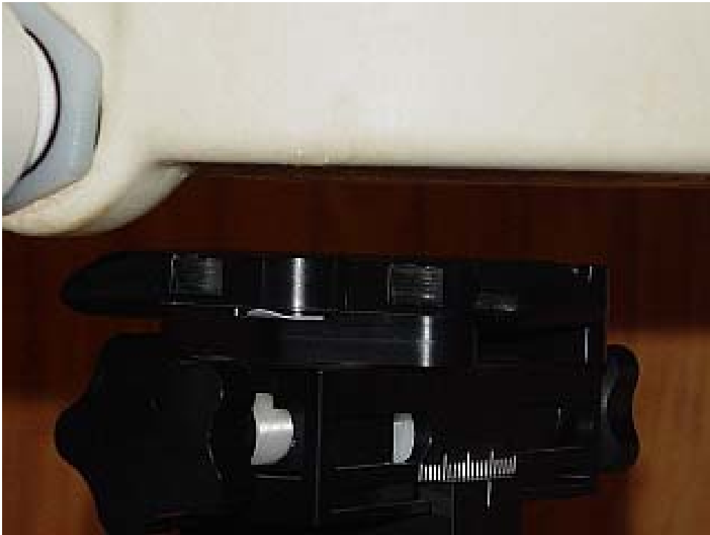
Figure 9E.3 Body SAR setup (15mm Air Separation - Back)