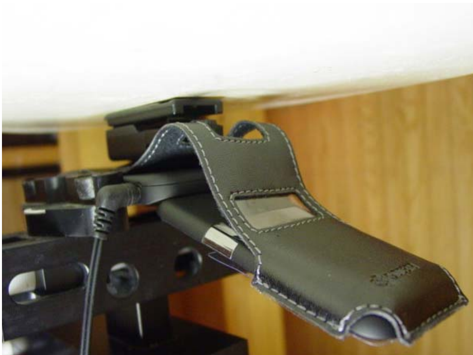
Figure 9E.4 Body SAR Phone setup Flip Opened (CE90-B3912-01)