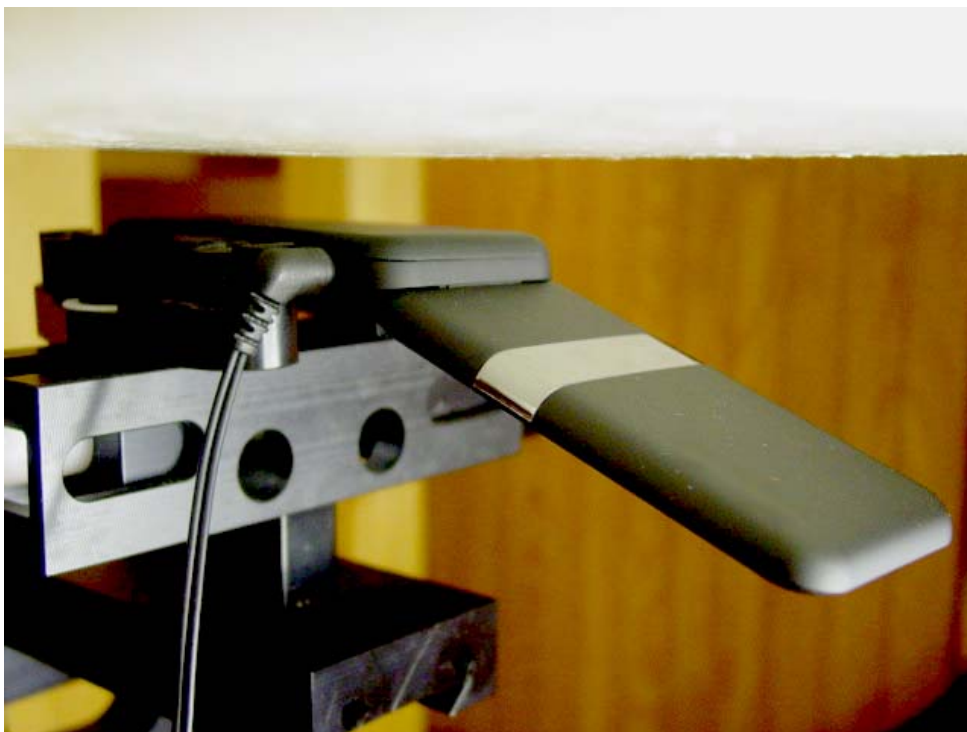
Figure 9E.4 Body SAR Phone setup Flip Opened (15 mm Air Separation)