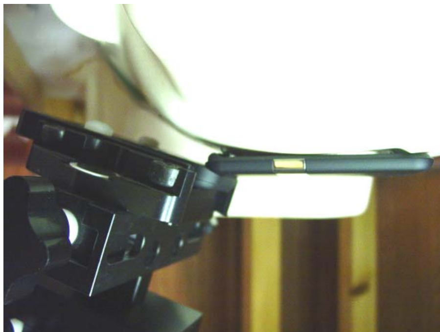
Figure 9E.1 Phone against the head (Left cheek position)