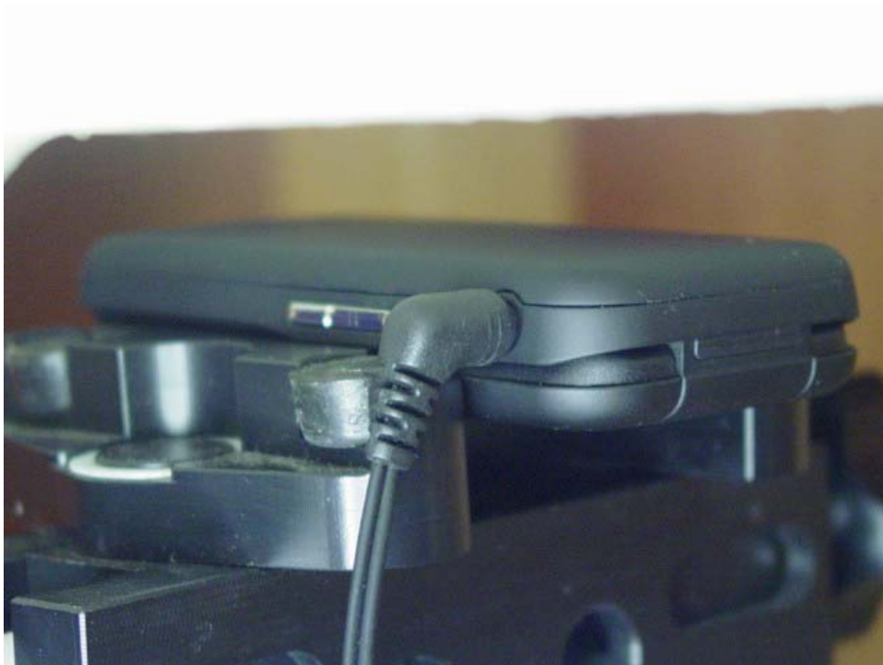
Figure 9E.3 Body SAR Phone setup Flip Closed (15mm Air Separation)