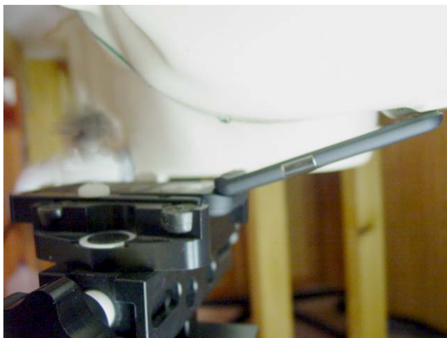
Figure 9E.2 Phone against the head (Left Tilt position)