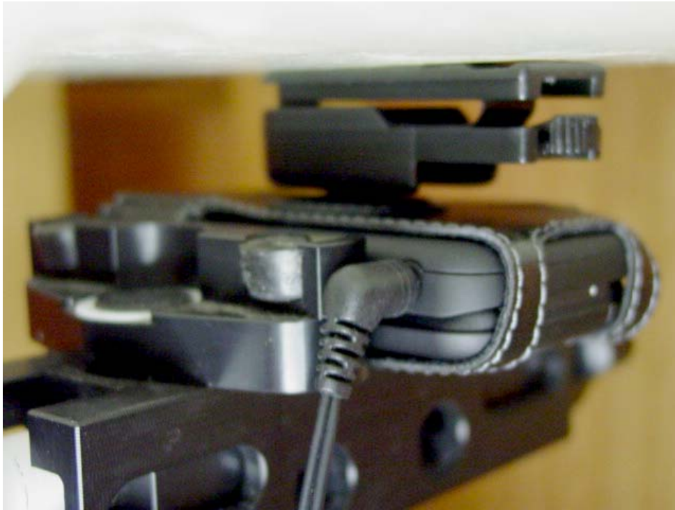
Figure 9E.3 Body SAR Phone setup Flip Closed (CE90-B3912-01)