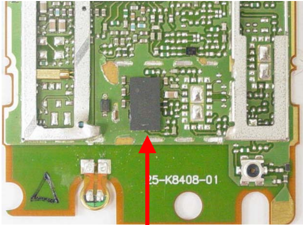
Original Power Amplifier