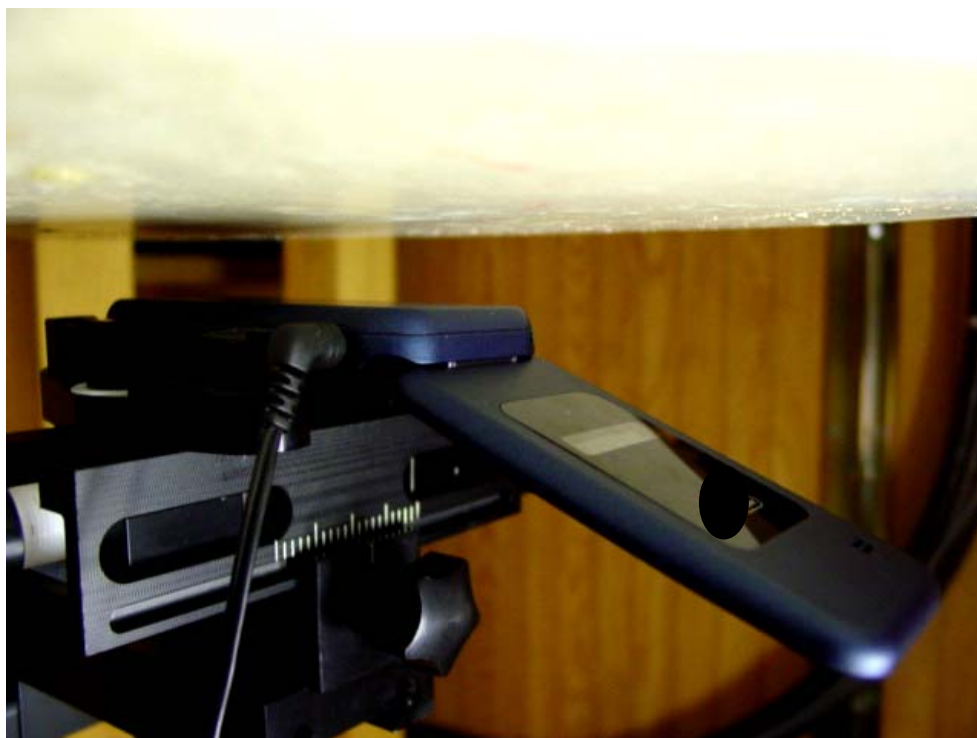
Figure 9E.4 Body SAR Phone setup Flip Opened (15 mm Air Separation)