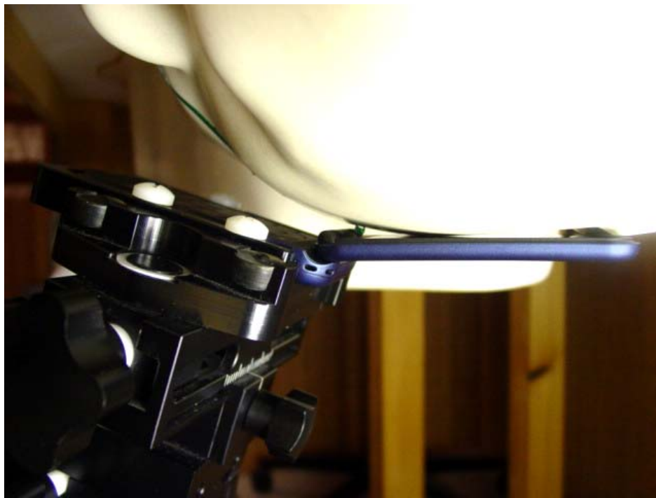
Figure 9E.1 Phone against the head (Left cheek position)