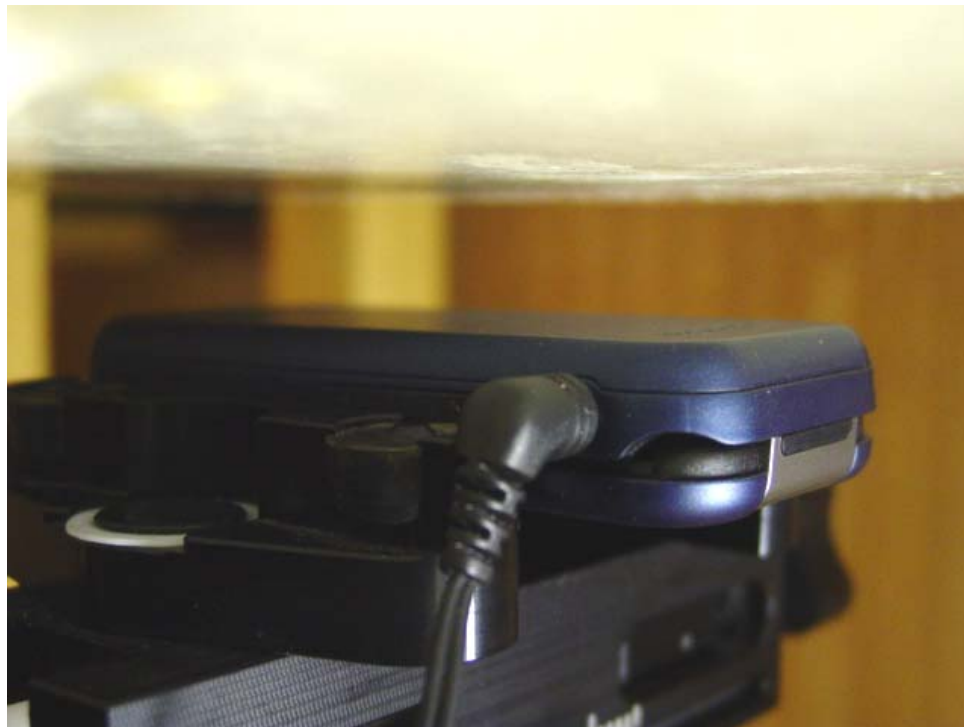
Figure 9E.3 Body SAR Phone setup Flip Closed (15mm Air Separation)