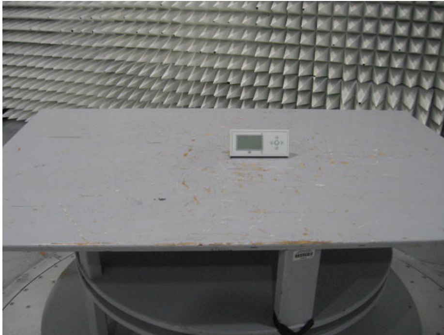
Radiated Emissions Test Configuration