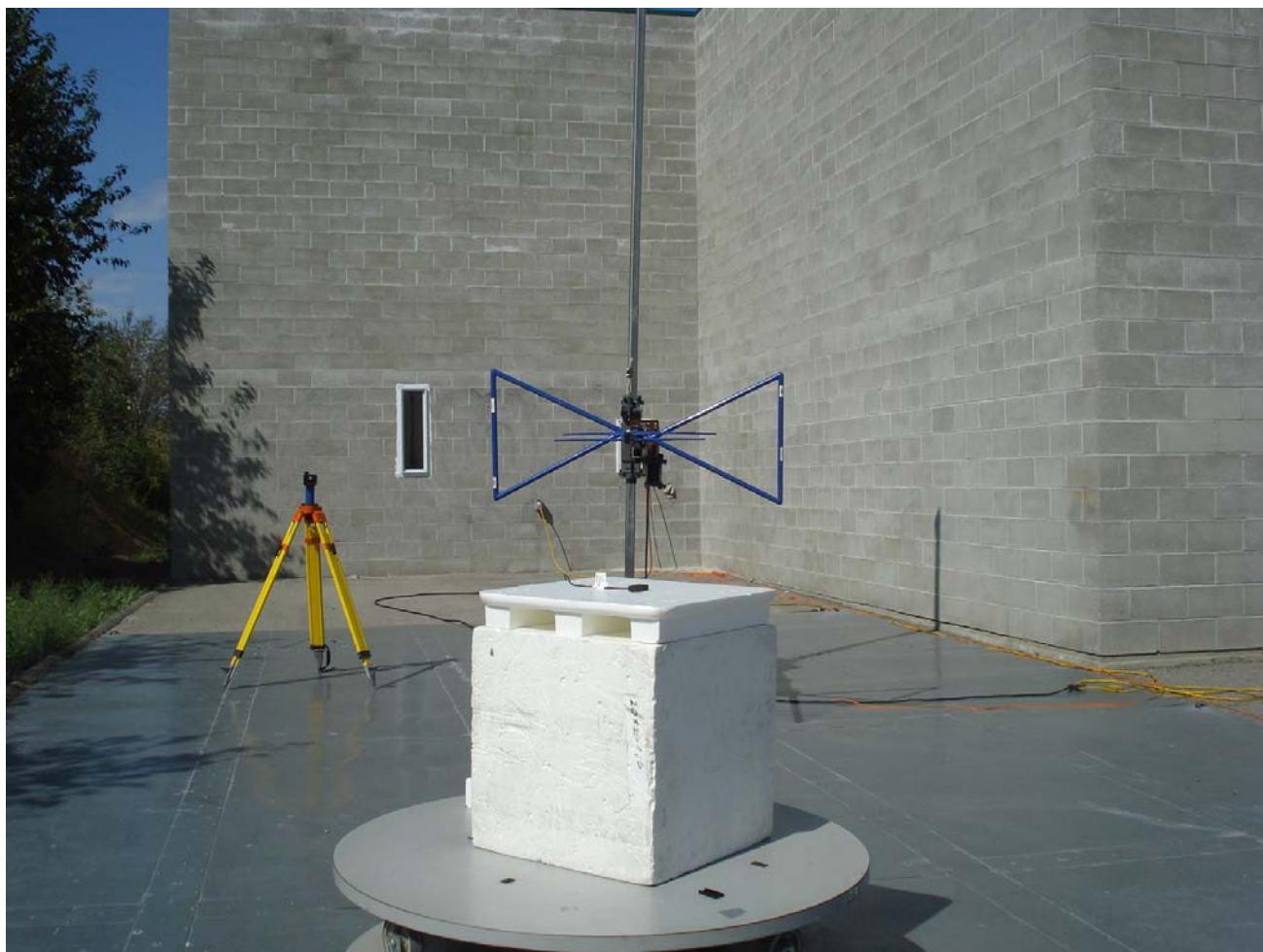
DUT Orientation X