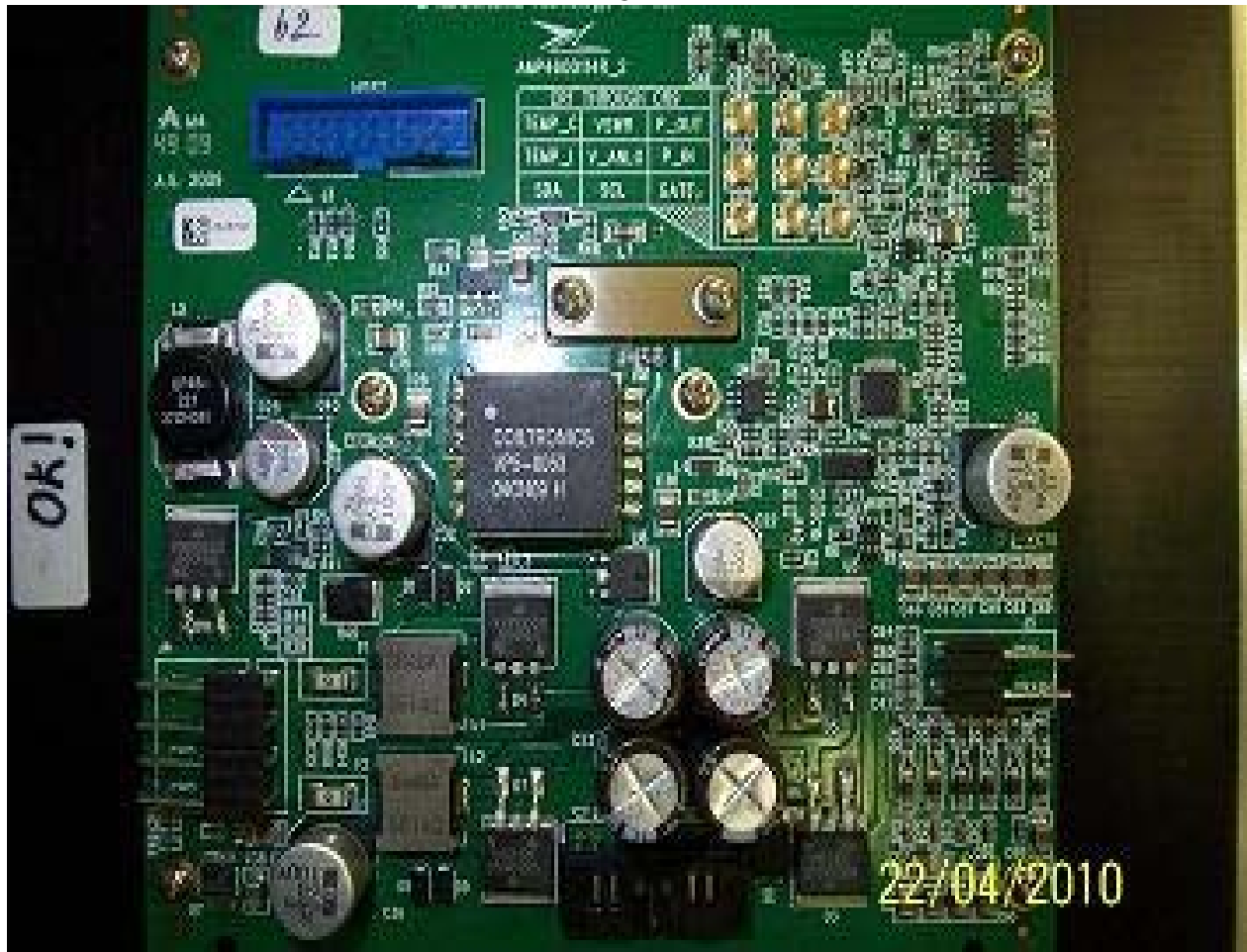
Control Board PCB for AMP460-1 FRONT