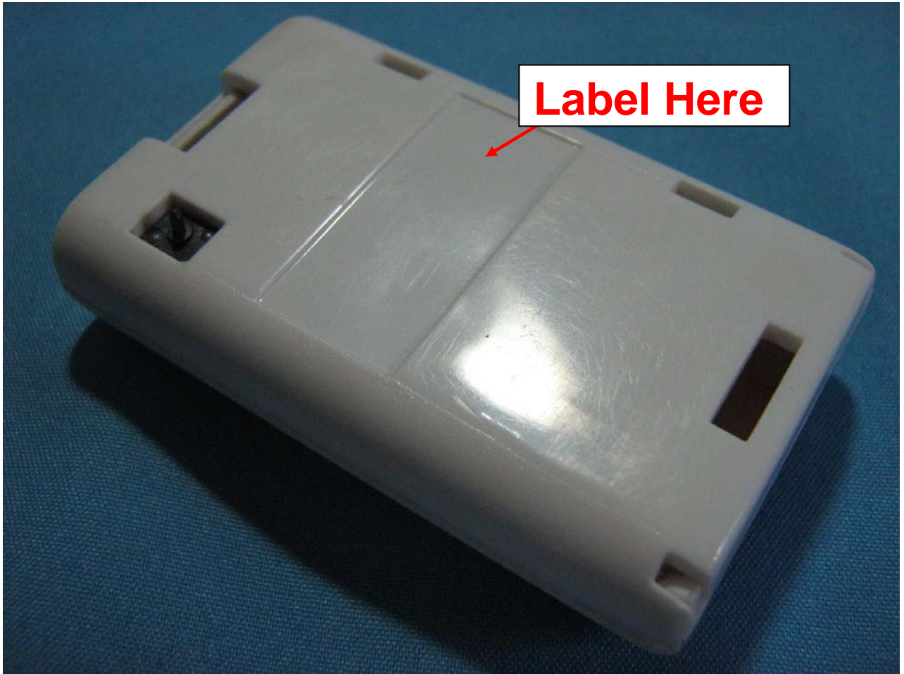
Module of Door Sensor 《 8HH2-10001 》