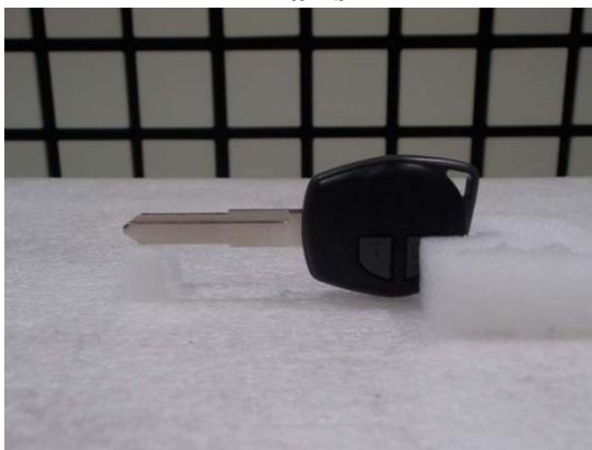
Without Key X-axis