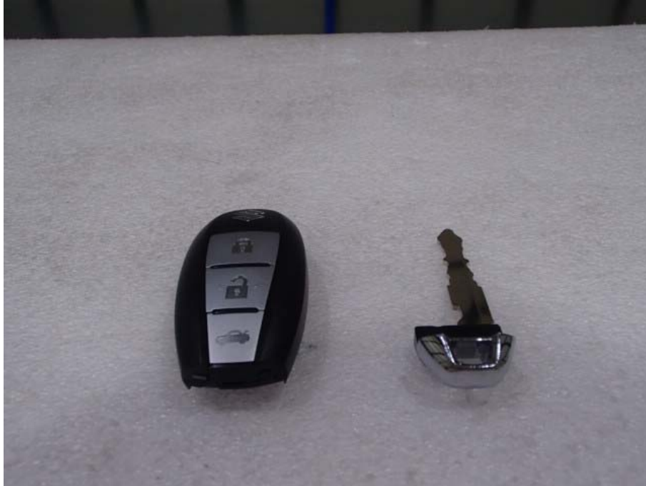
Mechanical Key (Not Inserted) Worst