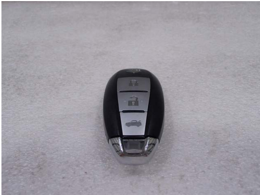
Mechanical Key (Inserted)