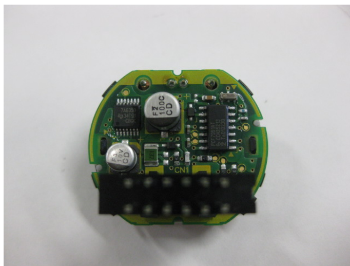
Figure 7.2.2 37290-79M0 PCB assy (bottom view)