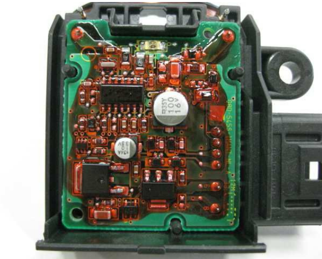
Figure 7.2.1 I54P0 PCB assy (front view)