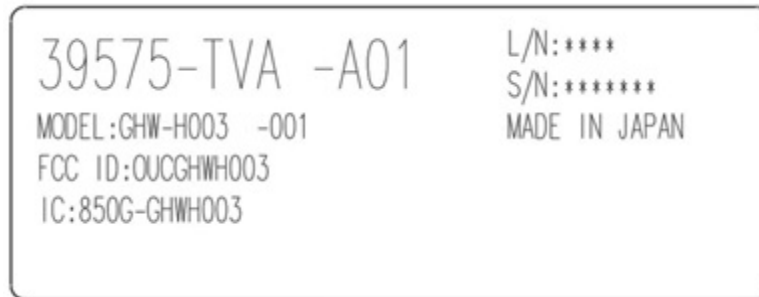
Figure 7.1 Label drawing

Note : 『GHW-H003』 is the model code, and 『-001』 is the Omron control number.