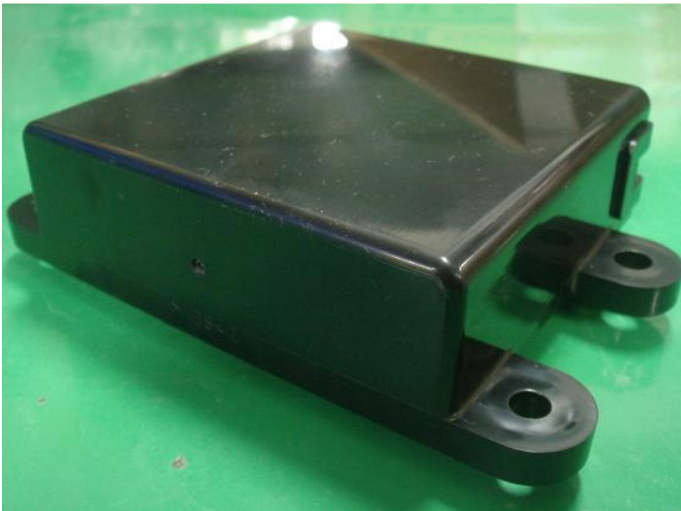
Figure 8.4 PCB assy (back view)