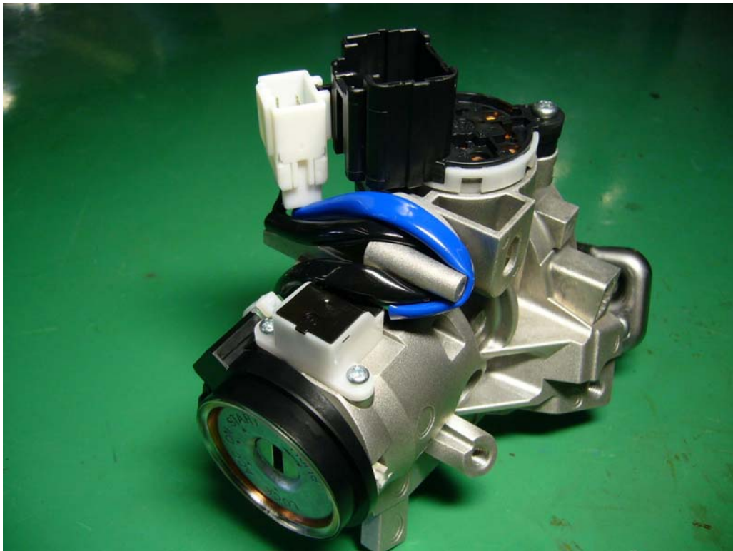
Antenna Appearance 1