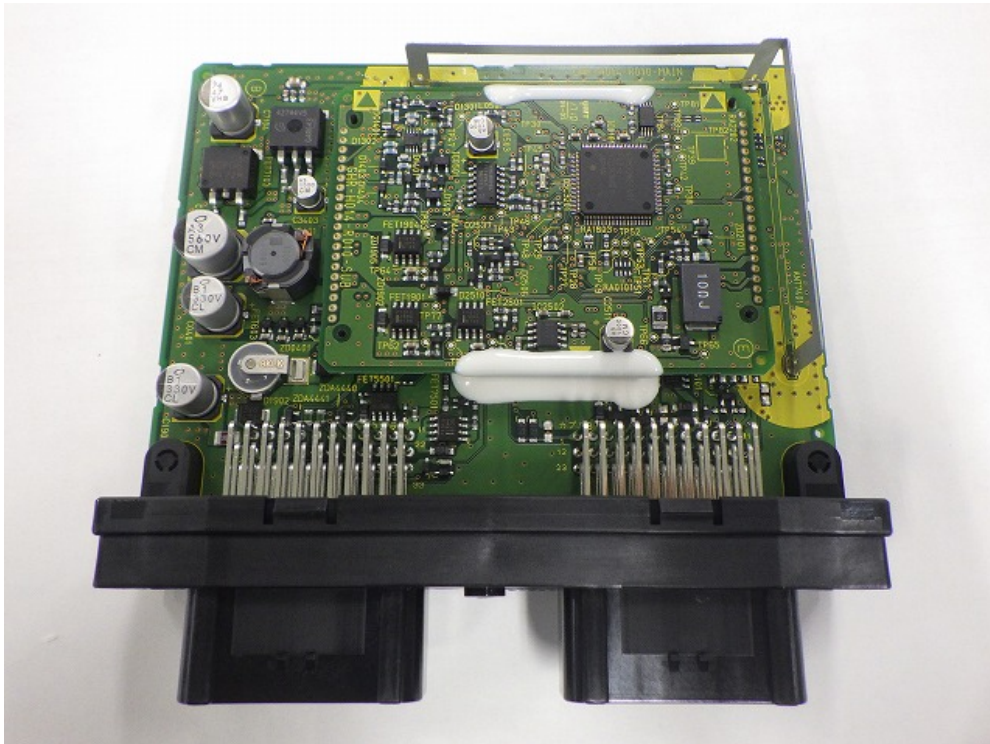
Figure 8.1 GHR-H014-R PCB assy (top view)