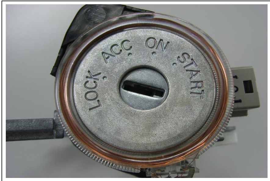
Figure 7.16 Antenna Coil (CloseUp4 View)