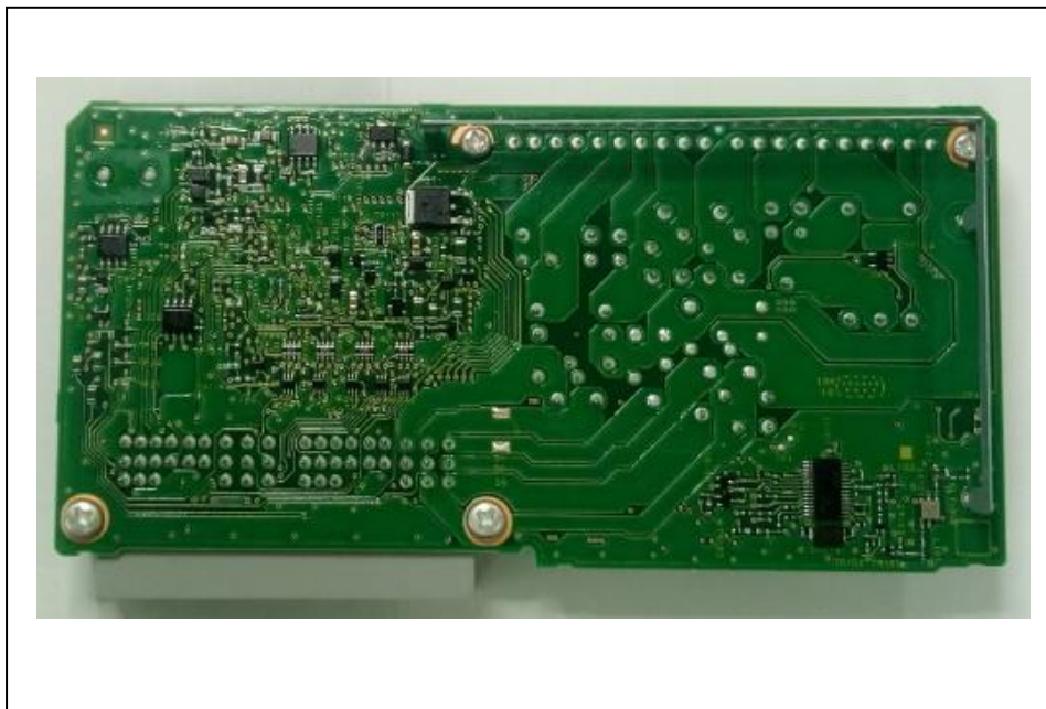
Figure 7.8 PCB ASSY (back view)