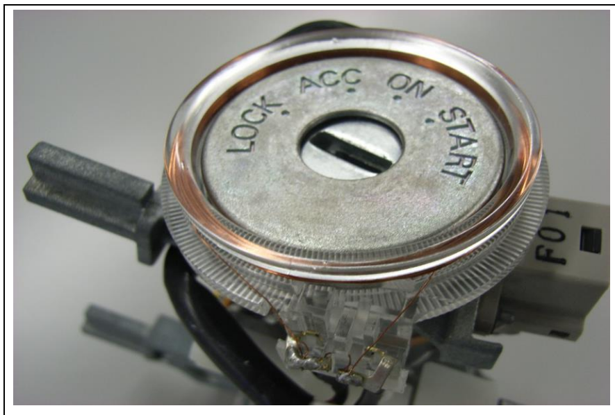
Figure 7.13 Antenna Coil (CloseUp1 View)