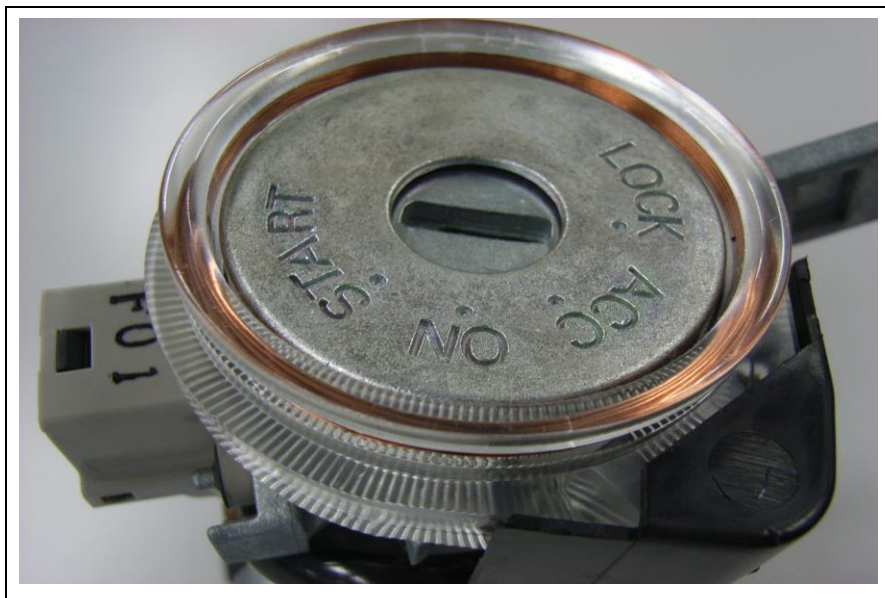
Figure 7.14 Antenna Coil (CloseUp2 View)