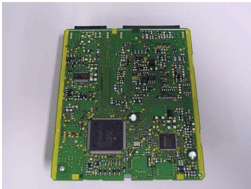
Figure 8.4 GGM-M007 PCB assy (back view)