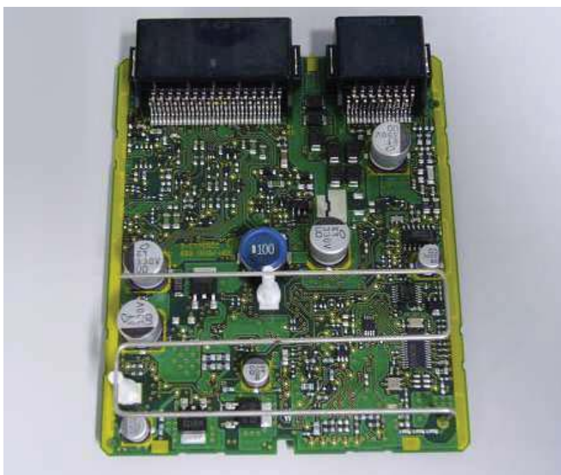
Figure 8.3.1 GGM-M007 PCB assy (front view)