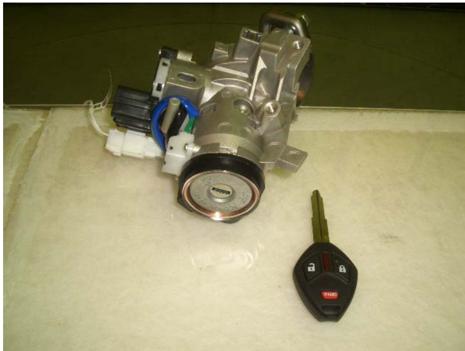
Without key (Worst)