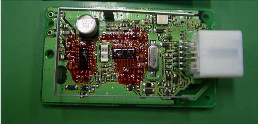
Figure 8.7 G8D-640M-RAM-N PCB assy (front view)