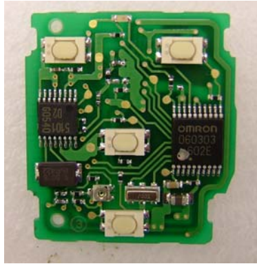
Figure 7.3 PCB assy (front view)