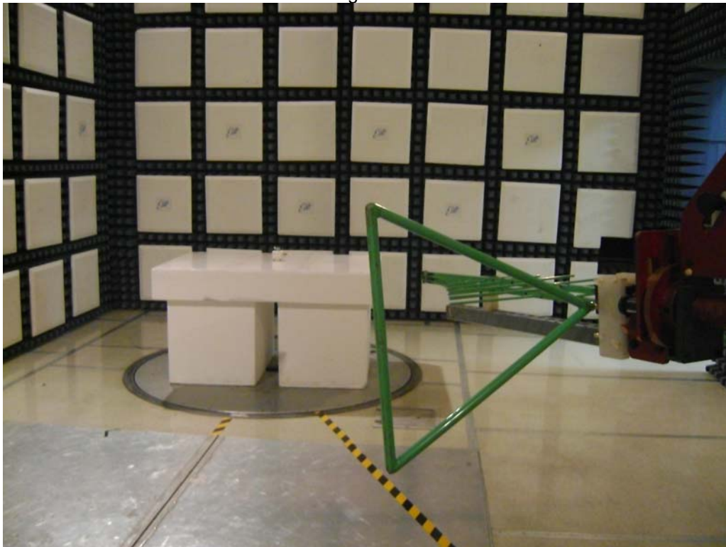
Test Setup for Radiated Emissions – Horizontal Polarity