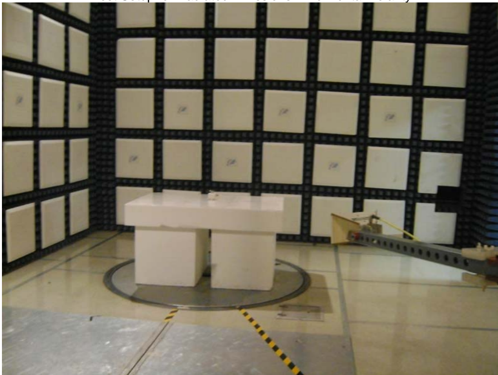
Test Setup for Radiated Emissions – Vertical Polarity