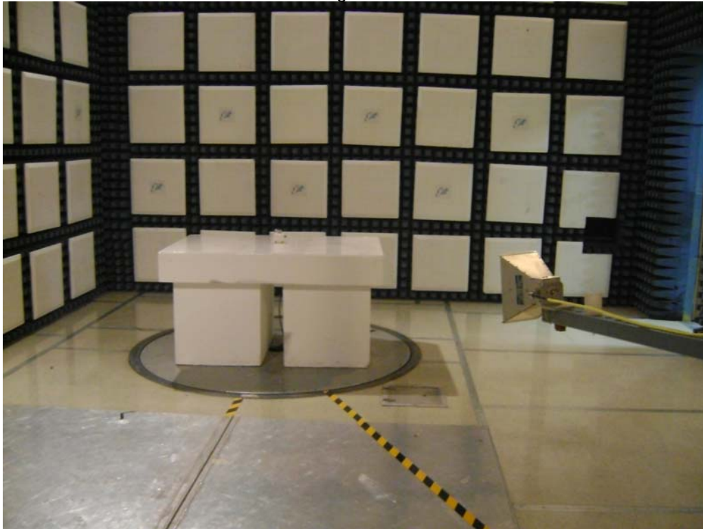
Test Setup for Radiated Emissions – Horizontal Polarity