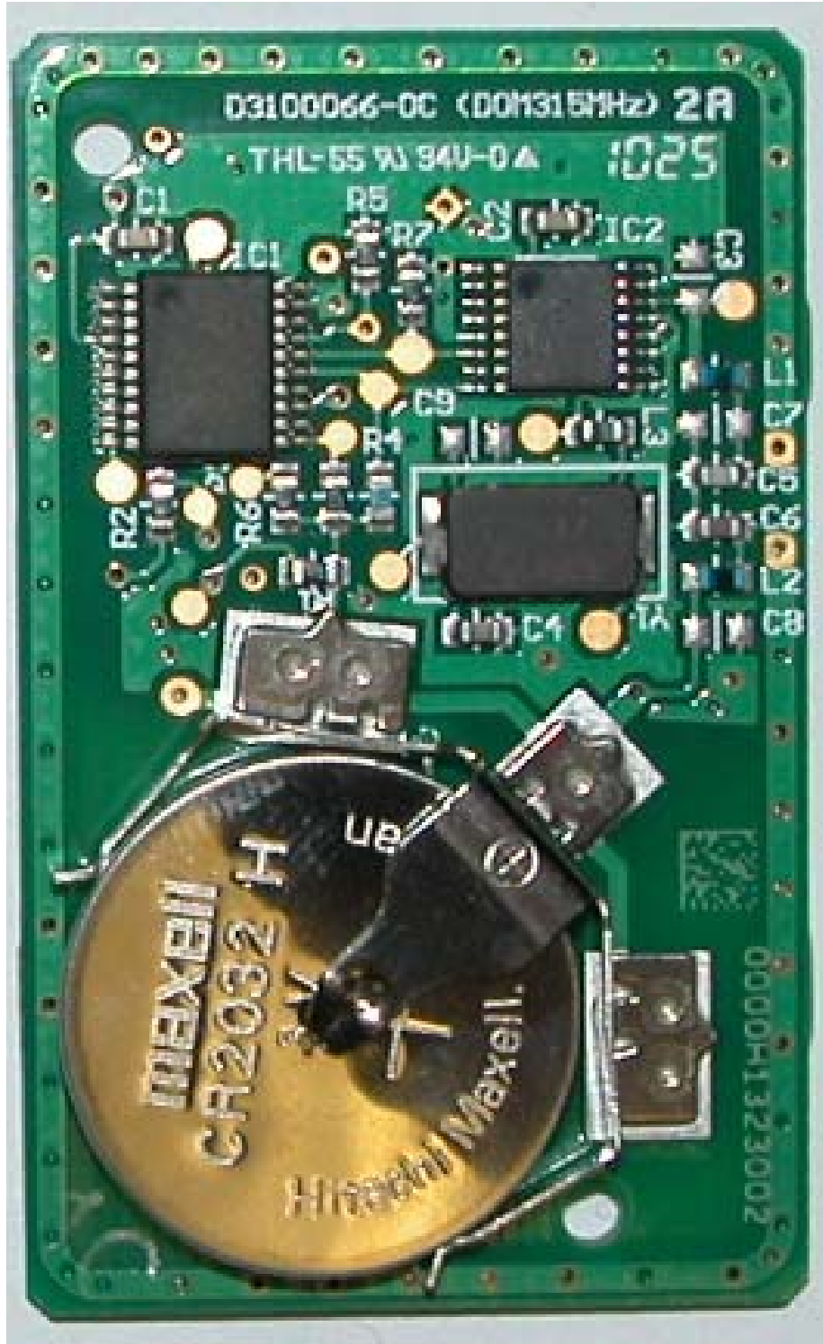
Figure 5. Topside of PCB