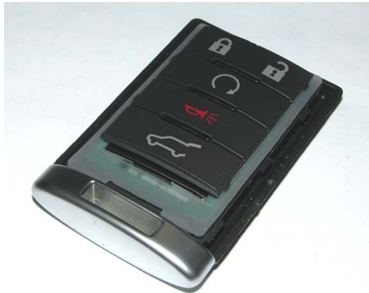
Figure 10. Keypad/Water seal, PCB, and lower case assembled