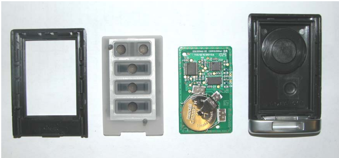
Figure 8. Individual pieces of final assembly