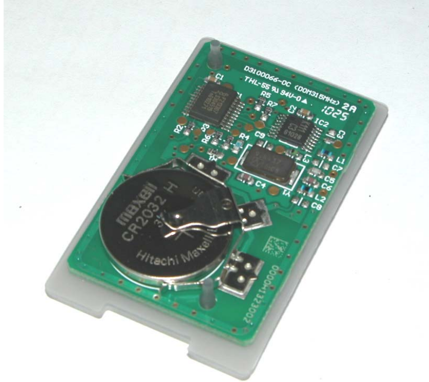
Figure 9. Keypad/Water seal attached to PCB