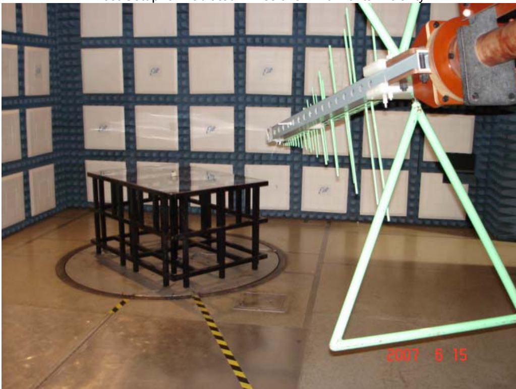
Test Setup for Radiated Emissions – Vertical Polarity