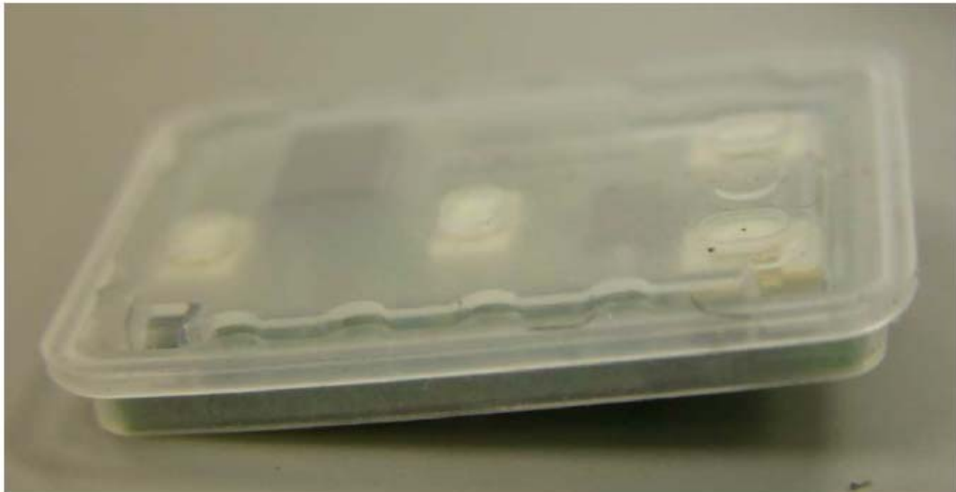
Figure 9 Water seal installed on PCB