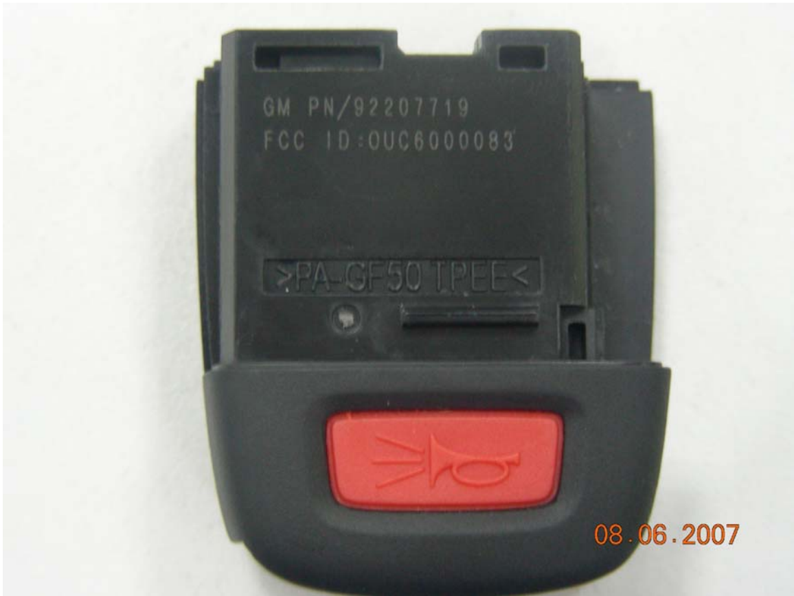
Figure 11. Final assembly lower case