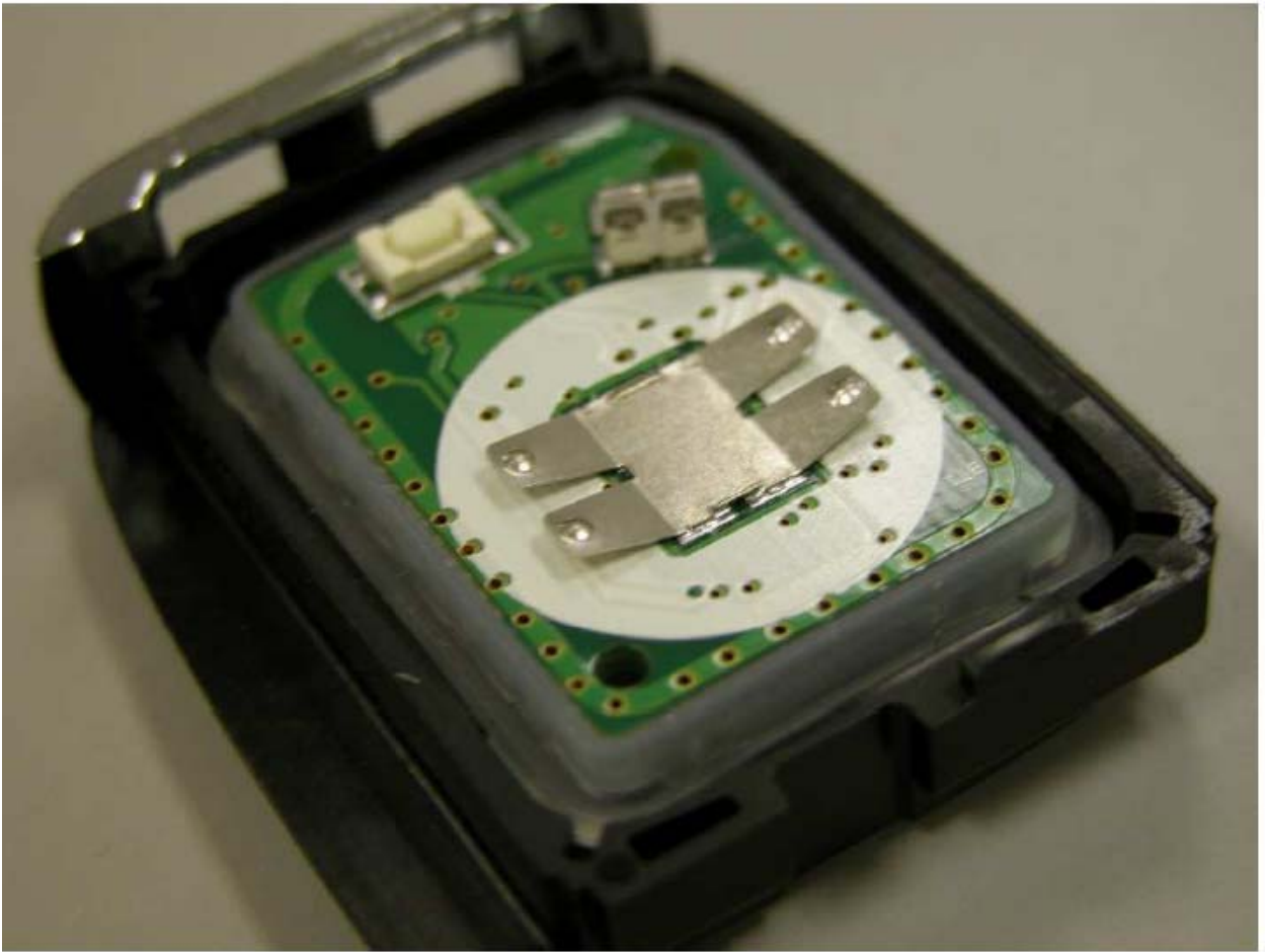
Figure 10 Water seal, PCB, and Upper Case assembled