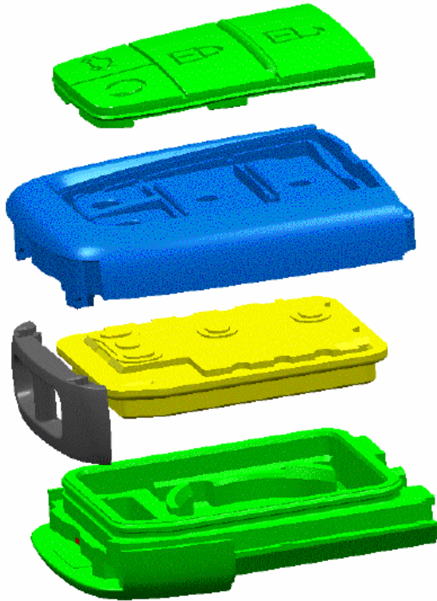
Figure 7. Mechanical Explosion of Case