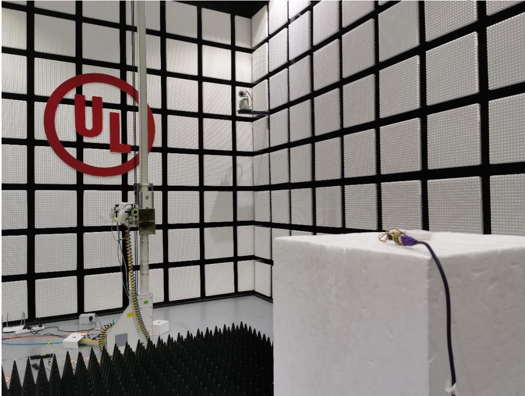
RADIATED RF MEASUREMENT SETUP (Above 1G – Y axis)