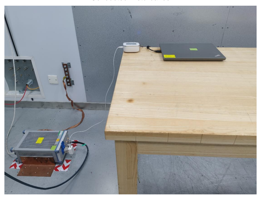
Radiated Disturbance below 1 GHz and above 30 MHz