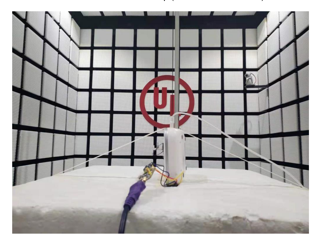
Radiated Disturbance Setup (Above 1 GHz - Z axis)