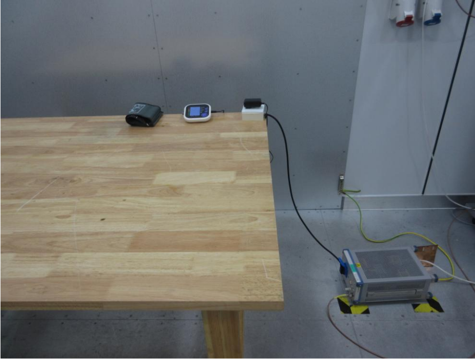
Transmitting spurious emission (below 1GHz)