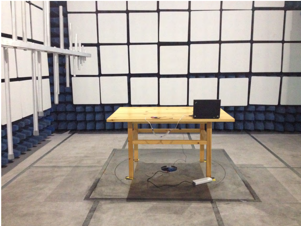
30MHz to 1GHz