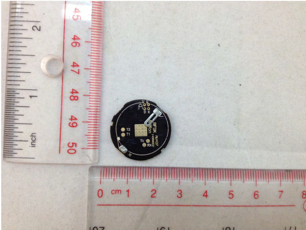
MAIN BOARD BACK VIEW 2