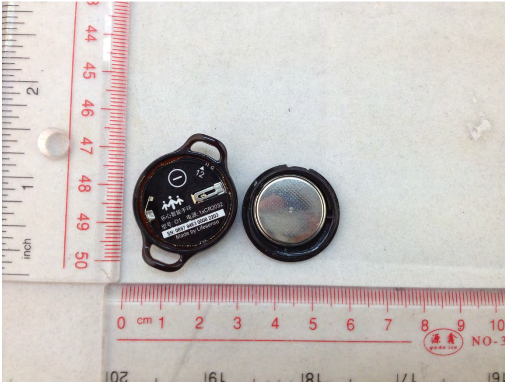
EUT UNCOVER VIEW 1