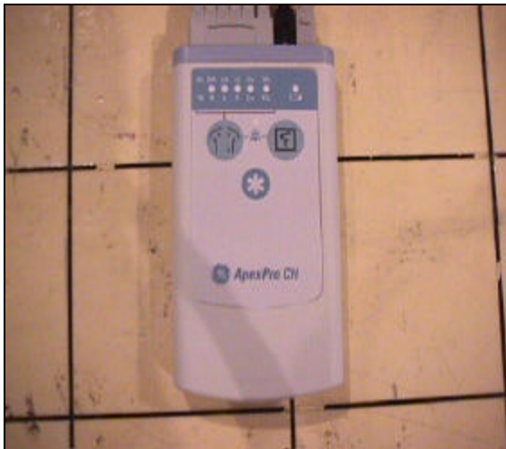
Close up view, front of the device.

Highest emissions noted were with the device in the side orientation as shown here.