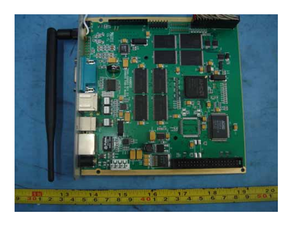
PCB1- Back View