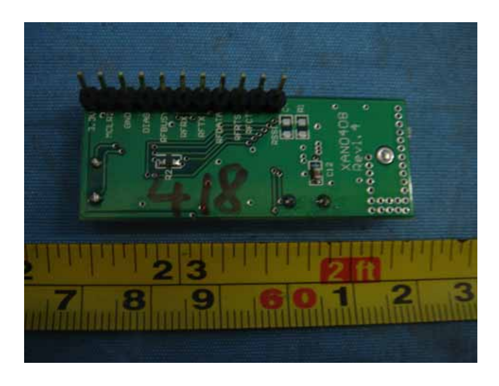
PCB3- Back View