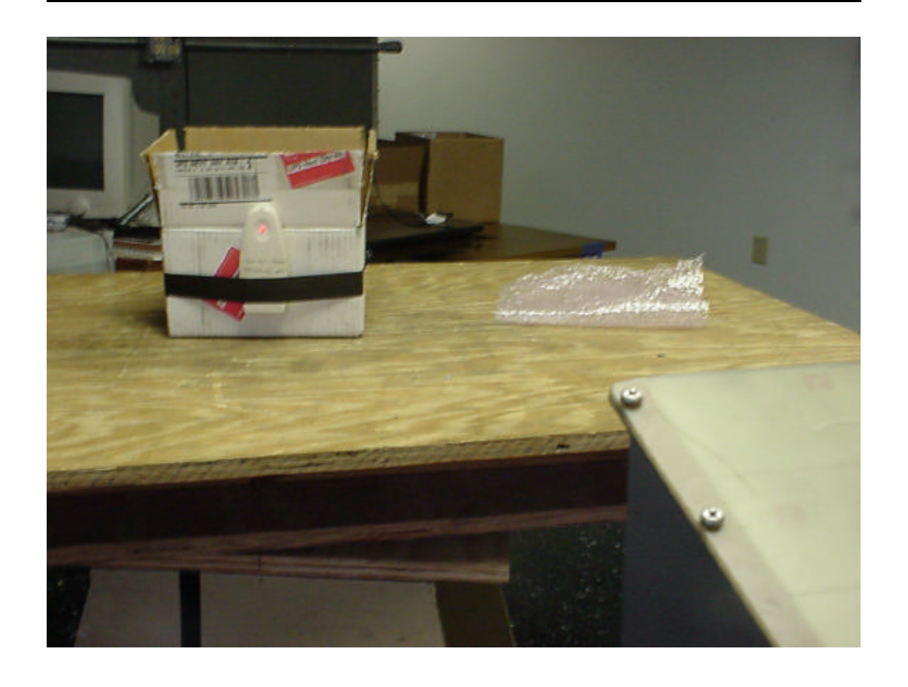
RADIATED EMISSIONS, HIGH FREQ. – FRONT OF UNIT