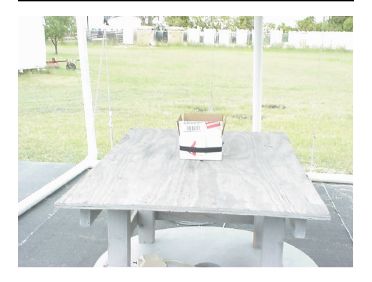
RADIATED EMISSIONS - FRONT OF UNIT