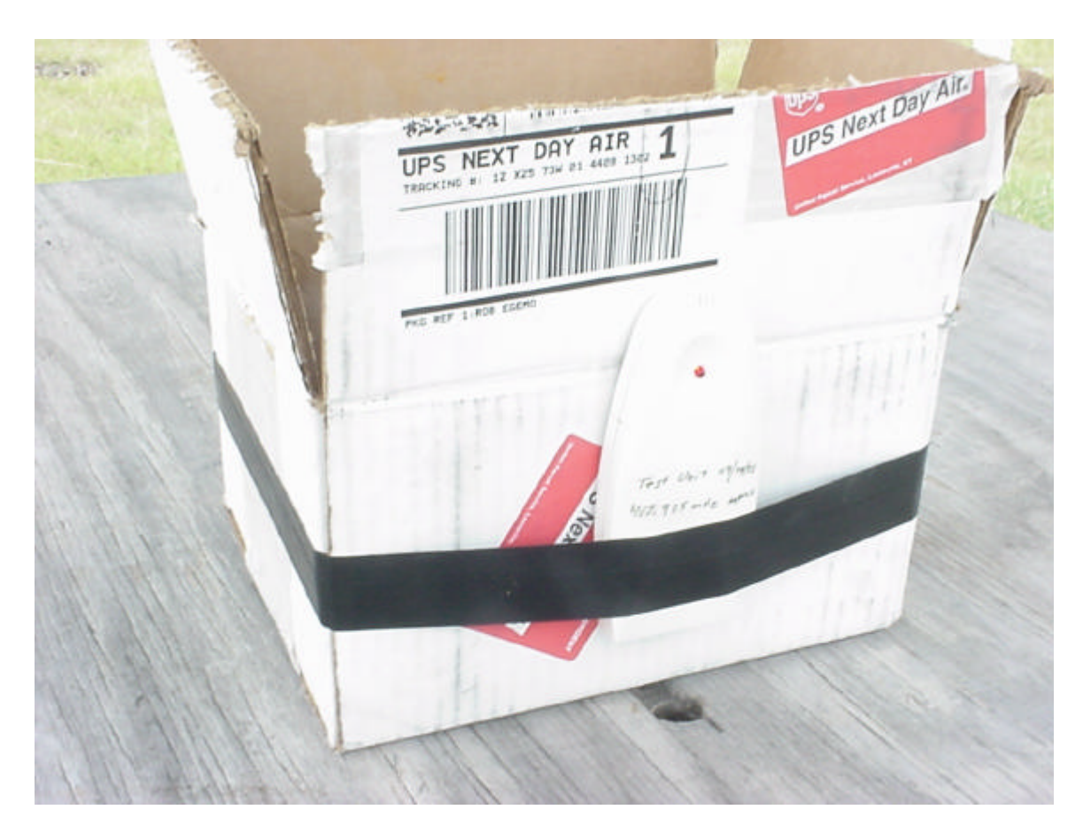
RADIATED EMISSIONS – UNIT SETUP