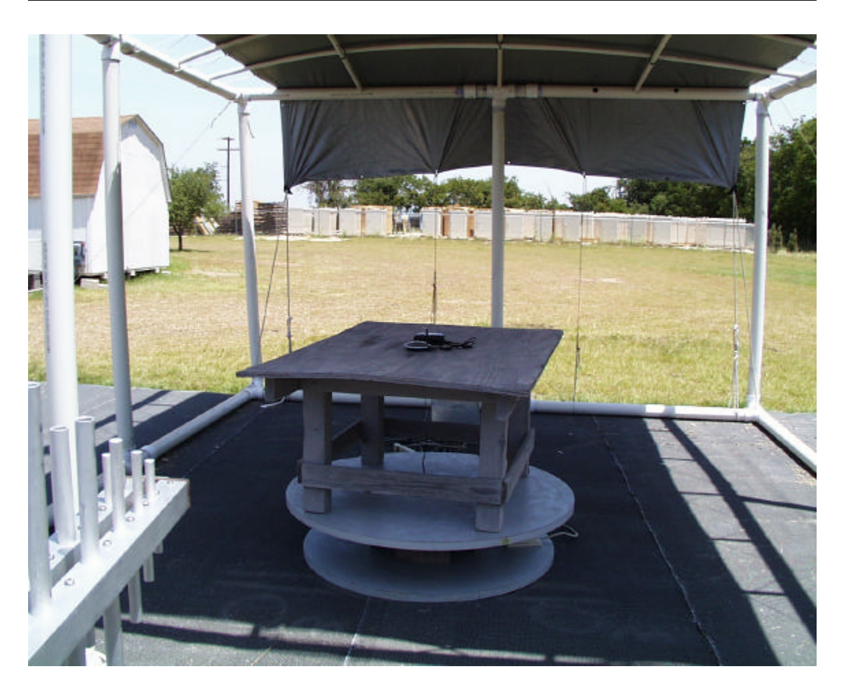
RADIATED EMISSIONS - FRONT OF UNIT