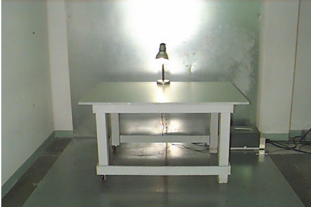
Maximized Conducted Emissions Test Set-up – Front View