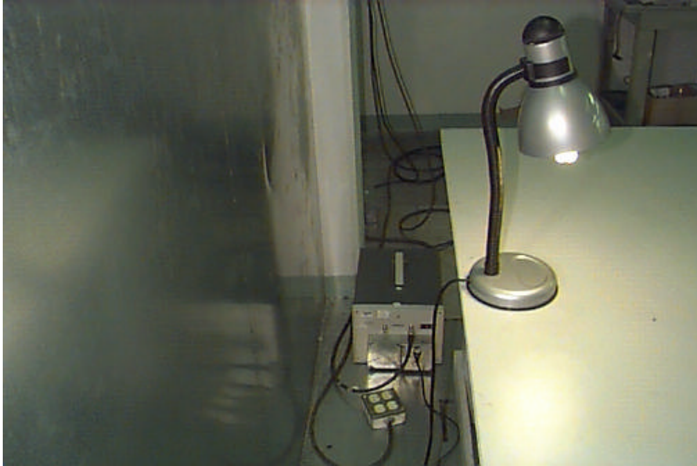
Maximized Conducted Emission Test Set-up – Rear View