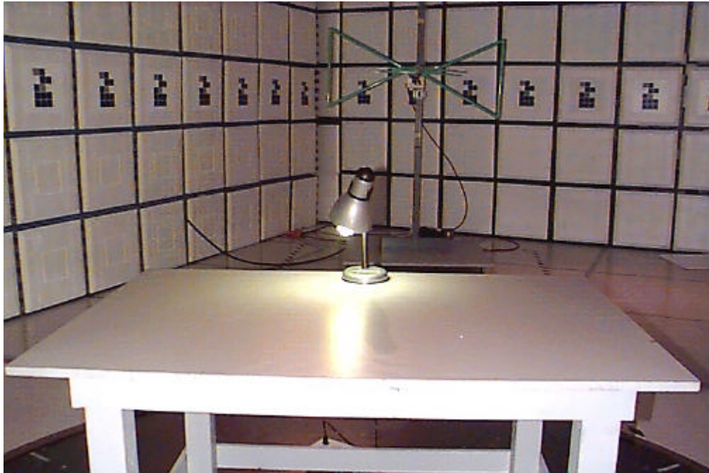
Maximized Radiated Emissions Test Set-up – Front View