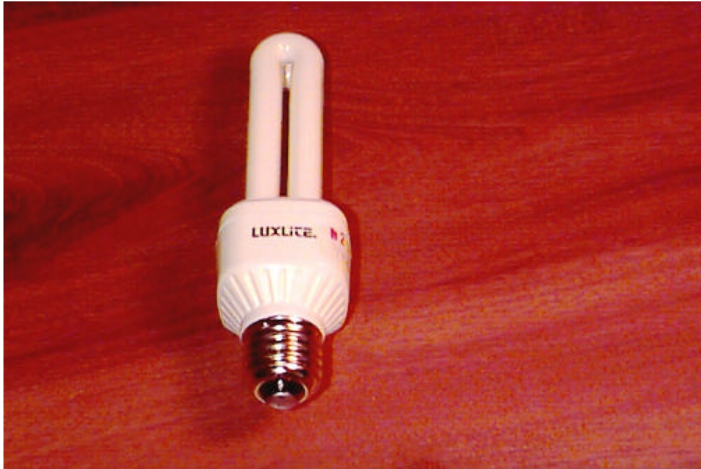
External Photo-EUT Front View