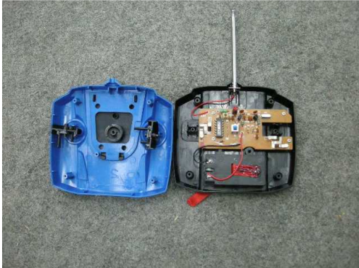
Internal View of the product