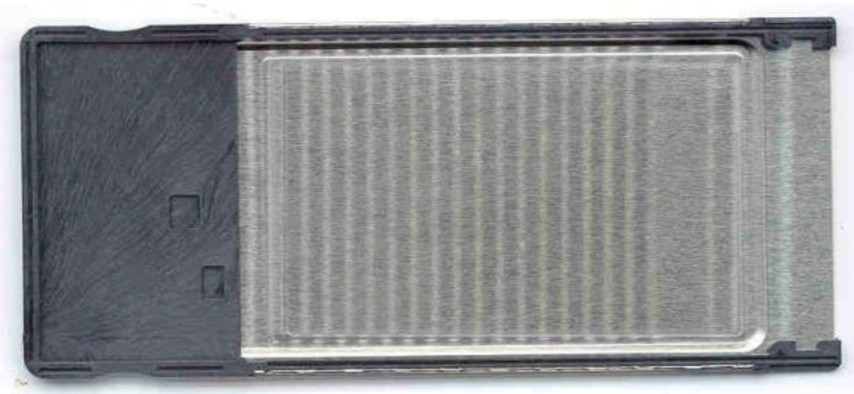
SHIELD BOTTOM INSIDE