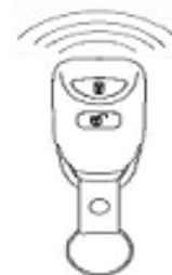
Transmitter f = 313.85\text{MHz}