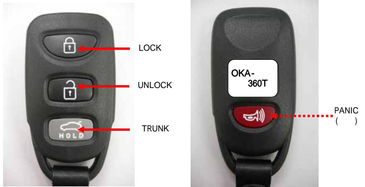
You can lock and unlock your vehicle with the remote transmitter.