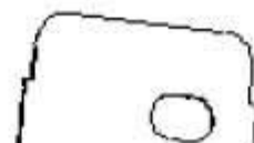
FIGURE 9.1 ST.