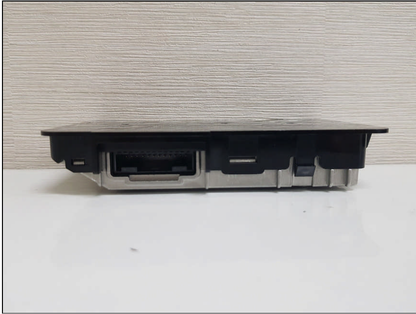
Rear view of EUT