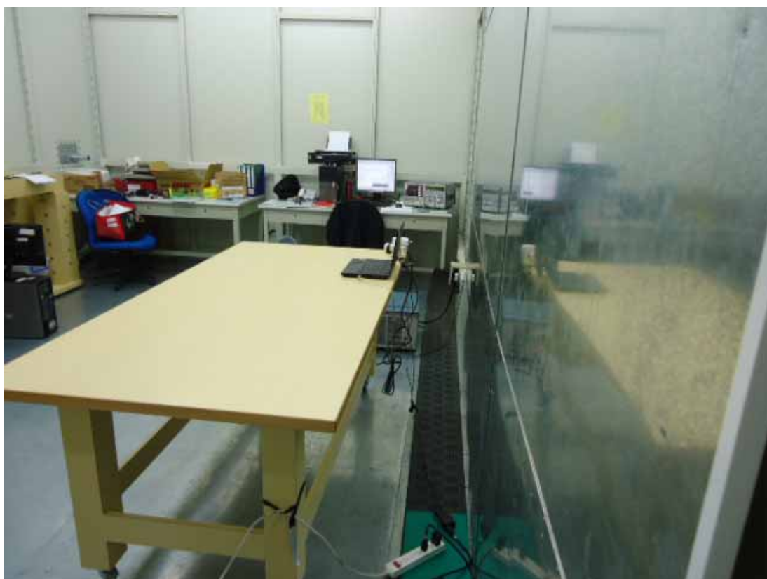
BACK VIEW OF CONDUCTED MEASUREMENT