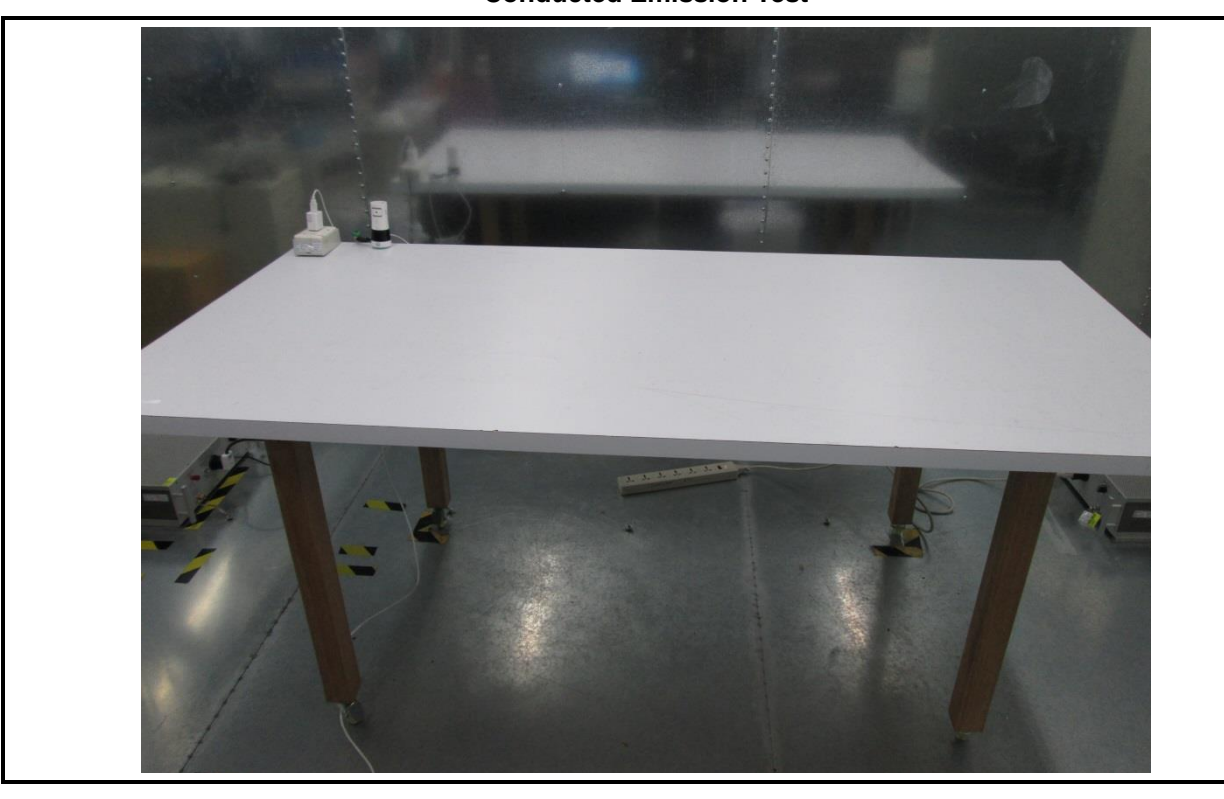
Conducted Emission Test