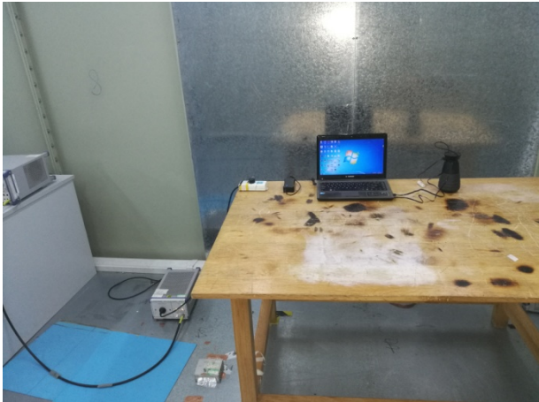
COMPLIANCE CERTIFICATION SERVICES (SHENZHEN) INC test above 1GHz emission