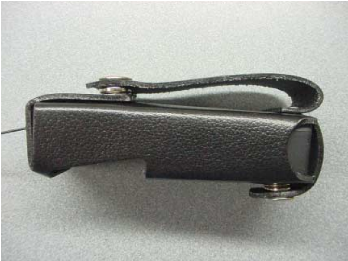
Side of Carrying Case