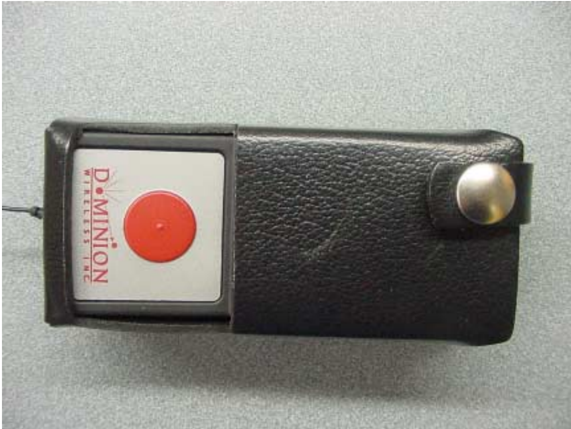
Front in Carrying Case