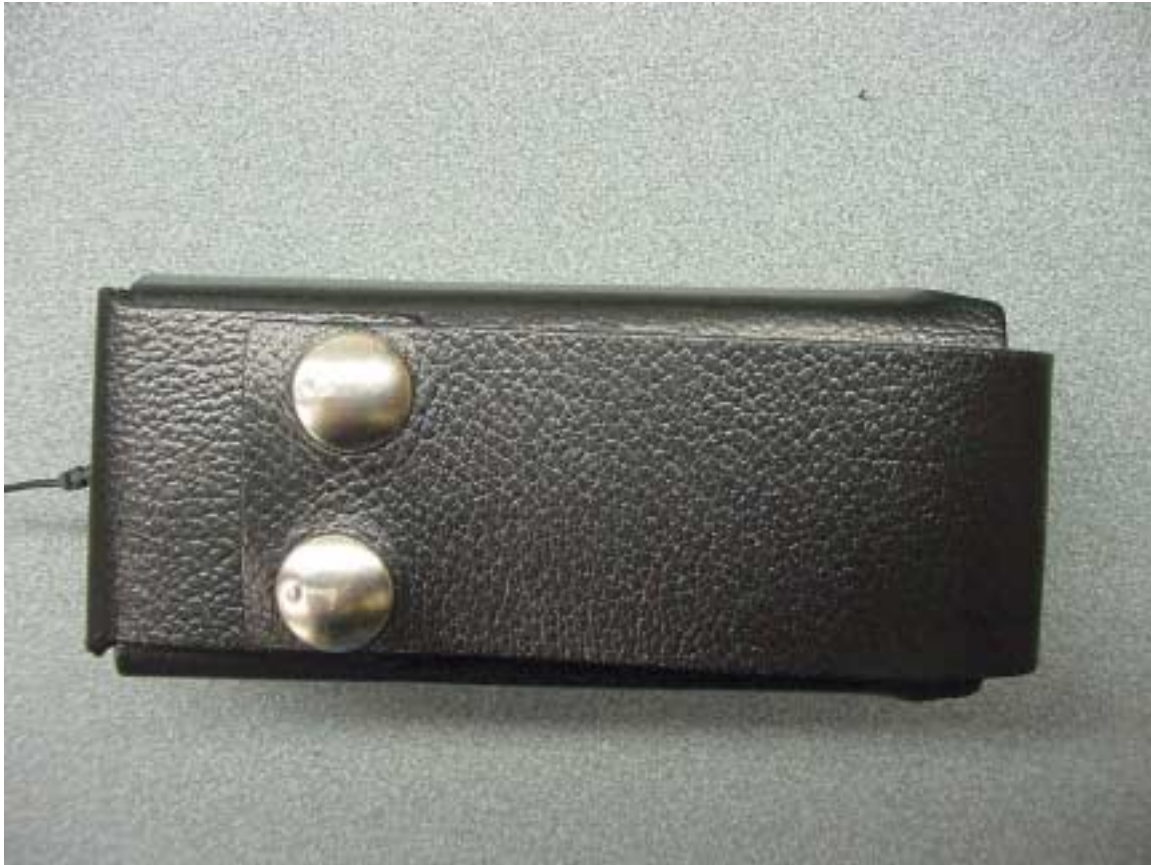
Back of Carrying Case