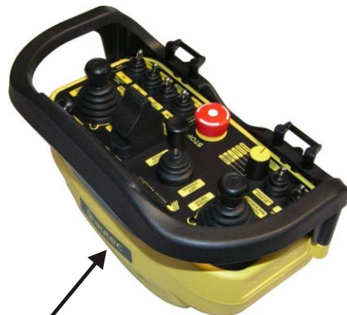
FJM label and its dimension