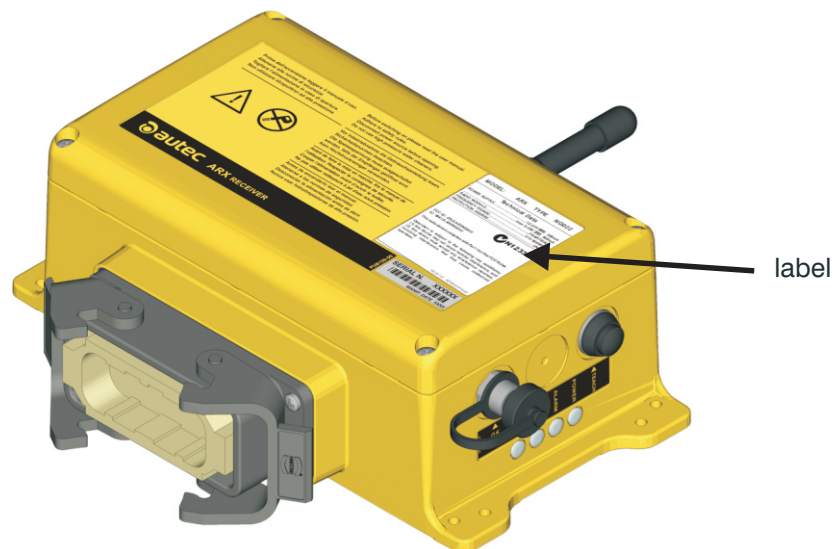
ARX label position