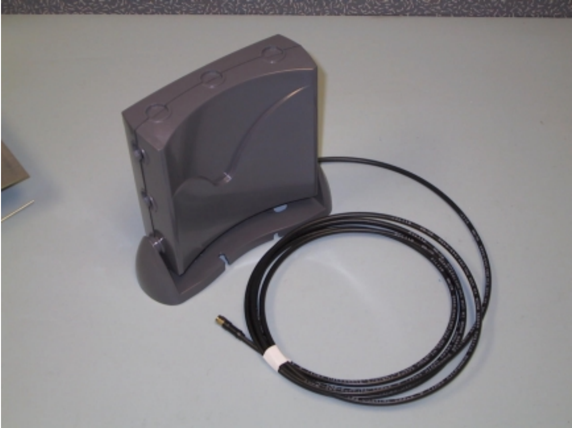
antenna unit view