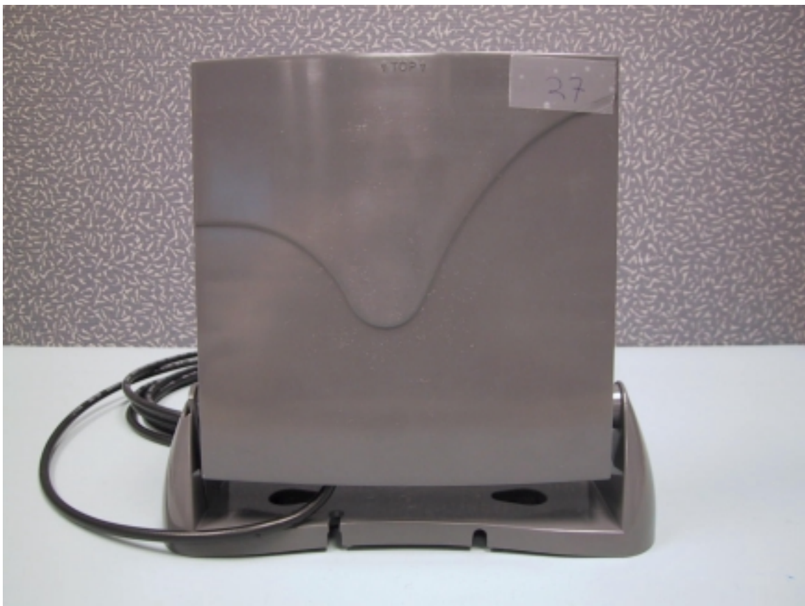
antenna back view