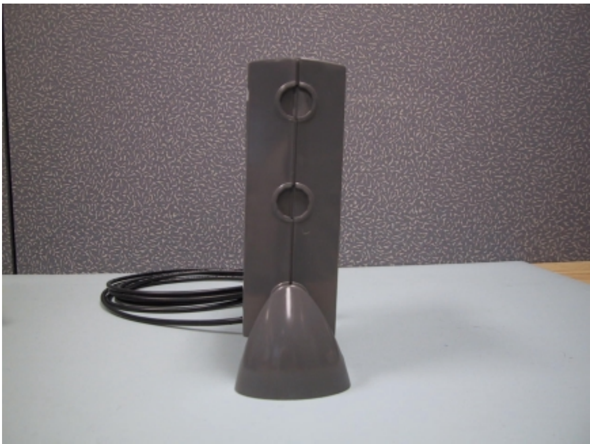
antenna side view