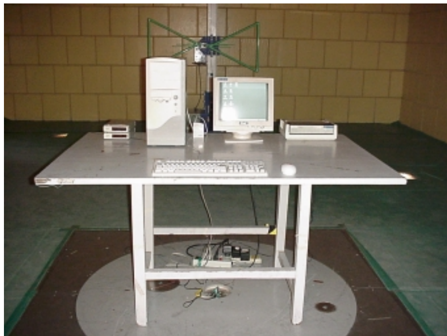
FRONT VIEW OF RADIATED MEASUREMENT