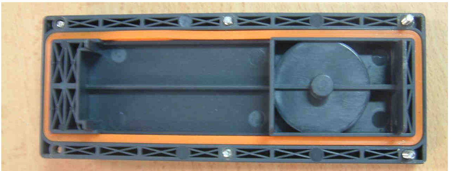
Internal cover view